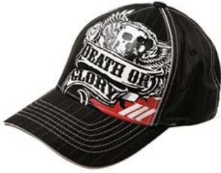
Contract Killer Give Me Glory Flexfit Hat