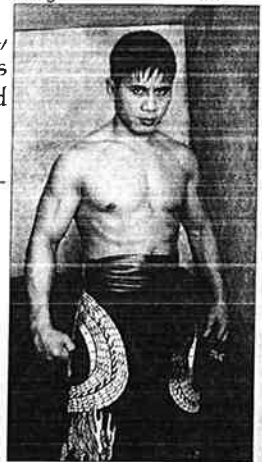
Cung Le as Marshall Law

For a complete review of Fighting , see www.KungFuMagazine.com . Stay tuned to KungFuMagazine.com for reviews of each of Cung Le's upcoming films, posted the week of their premiere. For more on Cung Le, check out our website archives for past cover stories and more exclusive e-zine articles, or visit his website at CungLe.com .